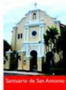
Santuario de San Antonio